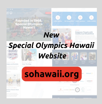
New Special Olympics Hawaii Website!

Join us for our Young Athletes event! The event is scheduled for Saturday, November 11, from 1pm to 2:30pm at Liholiho Elementary School. Click <a href="here">here</a> for the informational flyer and schedule and click <a href="here">here</a> for the participant registration form if you are new to the program. We are excited to see you there!